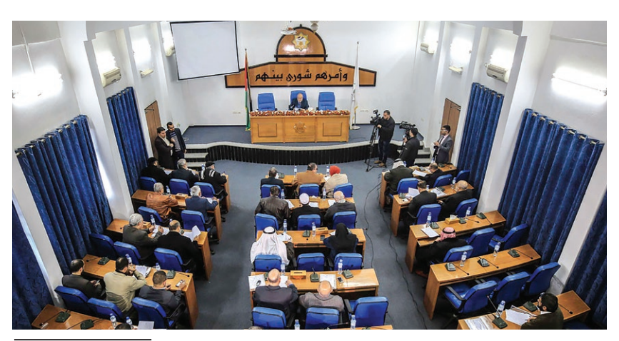
1.A study for "ADDAMEER" (Arabic for Conscience) Prisoner Support and Human Rights: entitled: the detention of the deputies of the Palestinian Legislative Council.